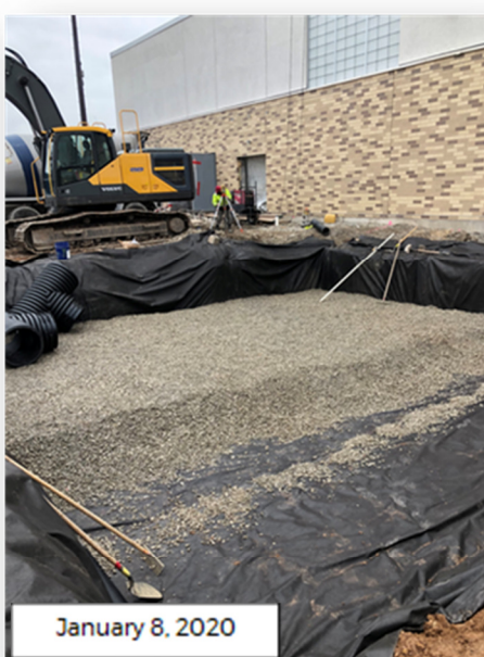
Phase 1 (New Gym Addition) West View of Underground Stormwater Detention System