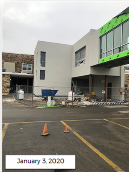
Phase 1 (New Gym Addition) East View Overhead Bridge Connector & Entrance