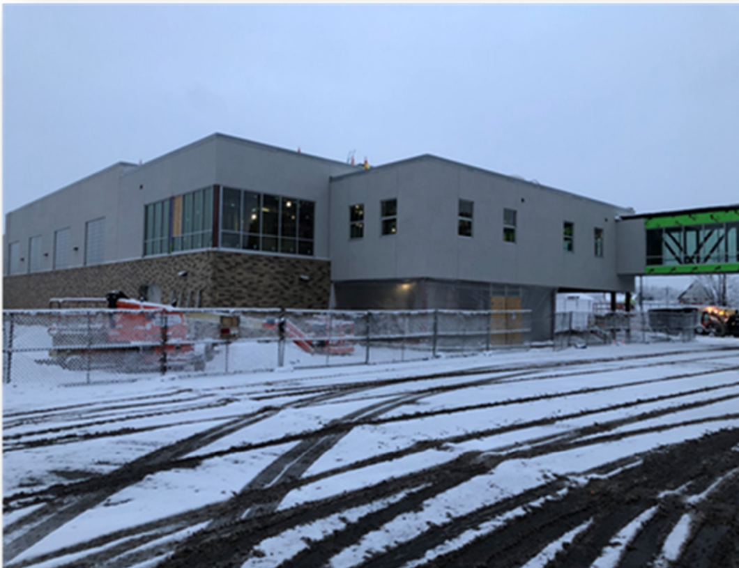
Phase 1 (New Gym Addition) Northwest View