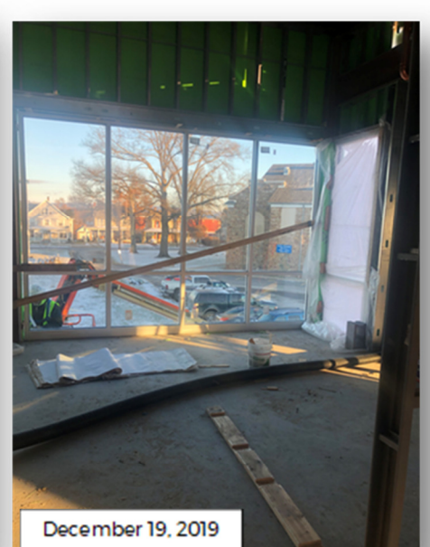
Phase 1 (New Gym Addition) North View of Hall D205