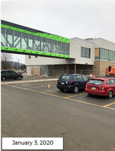
Phase 1 (New Gym Addition) West View of Overhead Bridge Connector - North Elevation