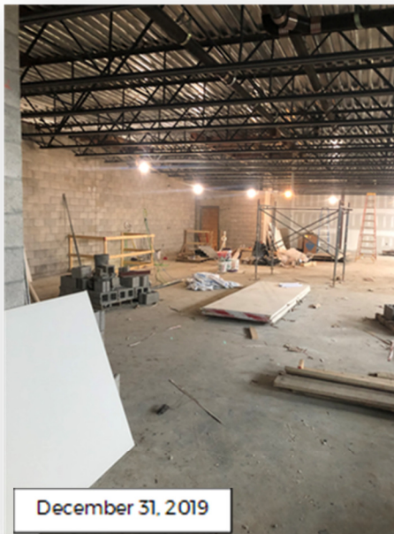
Phase 1 (New Gym Addition) South View of Wrestling Room D207