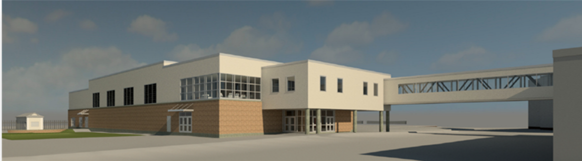
Phase 1 (New Gym Addition) Architectural Rendering Northwest View