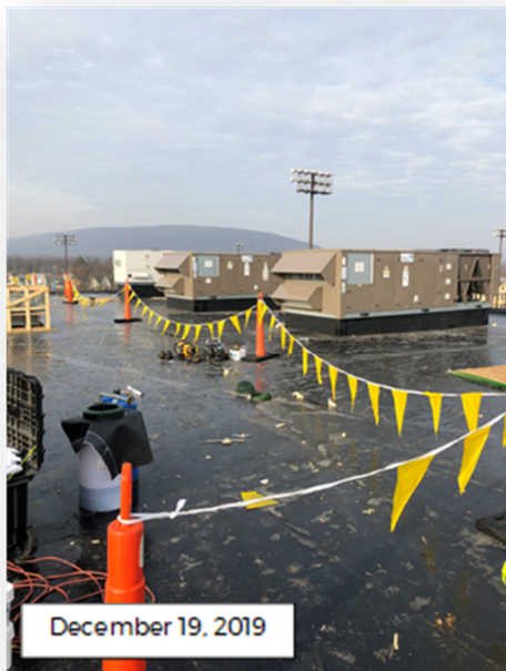
Phase 1 (New Gym Addition) Northwest View of New Rooftop Units