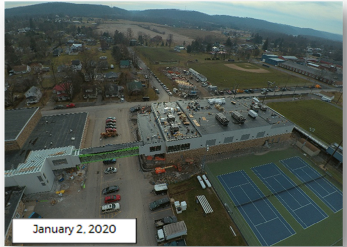
Phase 1 (New Gym Addition) South Aerial View of North Elevation