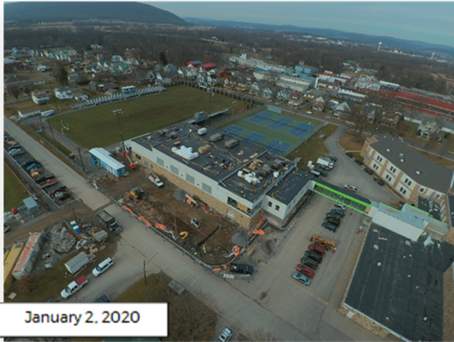
Phase 1 (New Gym Addition) Northwest Aerial View of South & East Elevations