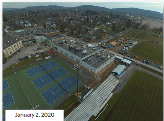
Phase 1 (New Gym Addition) Southeast Aerial View of North & West Elevations