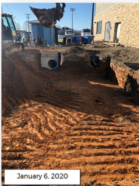
Phase 1 (New Gym Addition) West View of Underground Stormwater Detention System