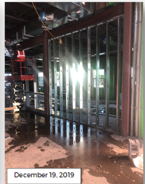
Phase 1 (New Gym Addition) Northeast View 2nd Floor Library D201 & CR D202