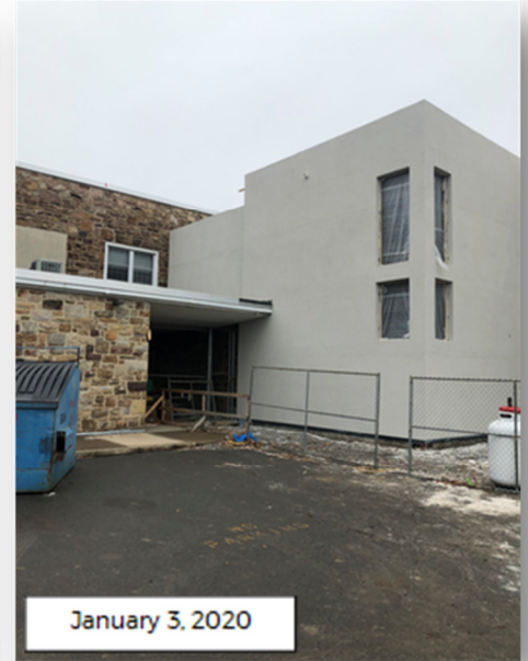
Phase 1 (New Gym Addition) Southeast View of Bridge Connector Stair Tower & Tie-in