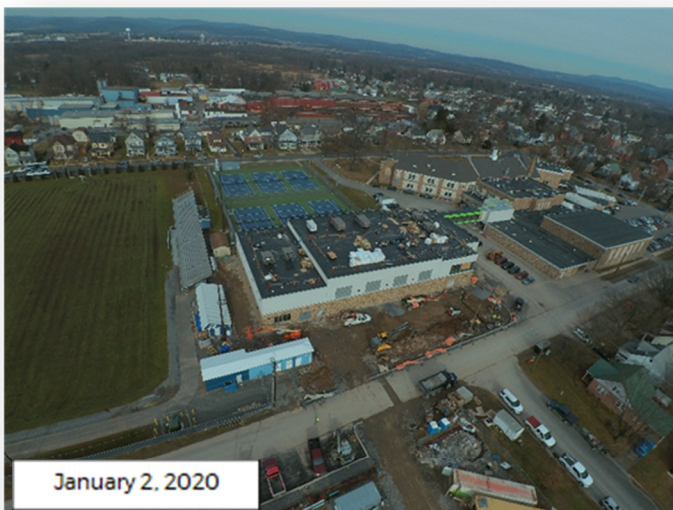
Phase 1 (New Gym Addition) North Aerial View of South Elevation