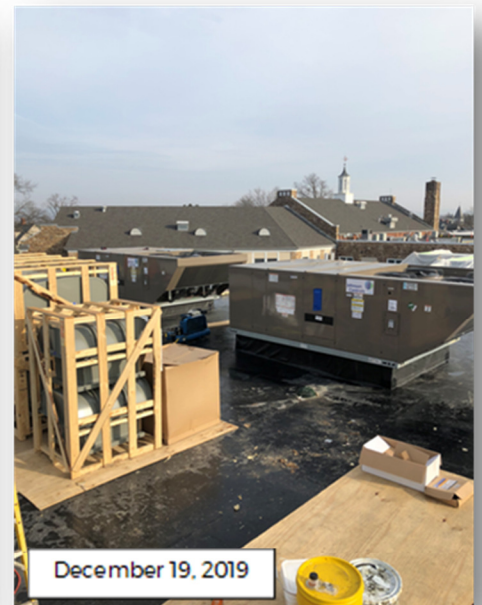
Phase 1 (New Gym Addition) East View of New Rooftop Units