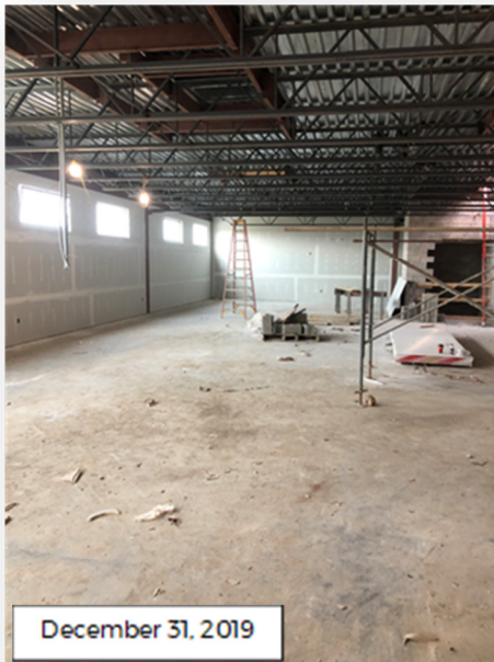
Phase 1 (New Gym Addition) North View of Wrestling Room D208