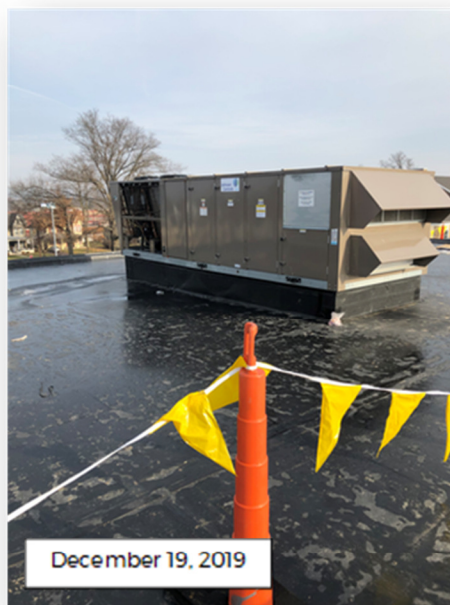
Phase 1 (New Gym Addition) Northeast View of New Rooftop Units